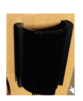
Fan Kit: KIT-FK-12 SPECTRA COOLING FAN KIT (12V)

FEED PUMP HEAT SINK SHURFLO PRESSURE SWITCH DIAPHRAGM DRIVE KIT