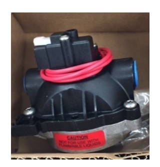
Diaphragm Drive Kit: